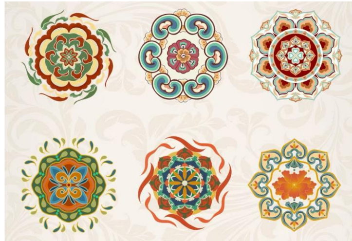
Figure 3: The Application of Religious Color in Pattern Design