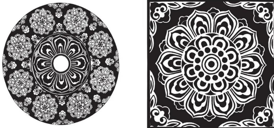
Figure 2: Lotus Flower Pattern Symbol

In addition to Buddhist symbols, other religious symbols are also widely used in modern design. For example, Christian crosses, Islamic stars and