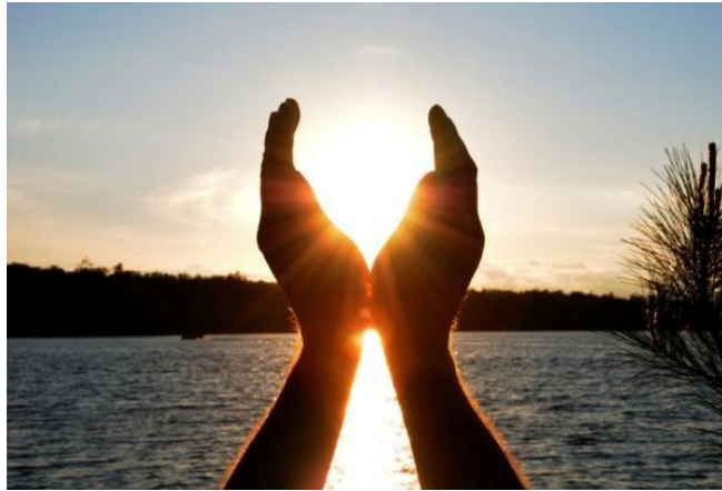
Figure 1: Religious Experience as a Justification for Belief

aspect of their existence. Their characteristics are, however, different, mostly due to interpretations based on cultures and religions.