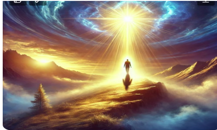
Figure 2: Verticality: Authenticity and Transcendence of Religious Experience

churning of different opposing experiences e.g., vision of Jesus and Krishna for a Hindu and a Christian respectively, resulting in the question of which experiences, if any, are authentic.