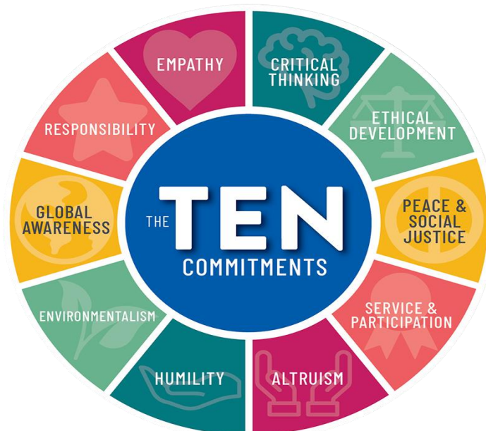
Figure 4: The Principles That Under Humanistic Organizations

We recognize four fundamental qualities from the writing on humanistic administration and administrations that support both our applied system and our proposed typology. We then, at that point, talk about the central standards of our structure's activities: regard, trust, reasonableness, and inclusivity. Figure 4 shows the principles that under humanistic organizations.