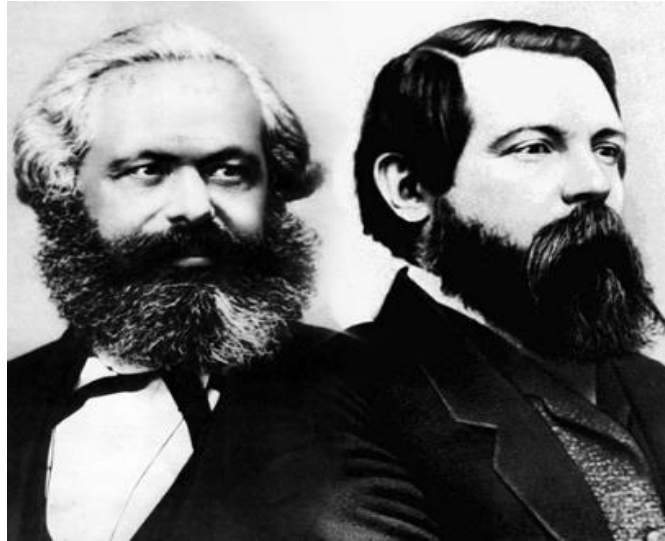
Figure 2: Engels and Marx

The focal point of this piece is higher education since it comes not long prior to entering the labor force. The instrumental view is more pervasive than the natural view at this phase of tutoring contrasted with lower levels of education. Higher education has forever been presented through colleges. Scholastic freedom was first taken on as the foundation of its way of life at the College of Bologna, the primary made organization in Europe. These are the college school, the examination college, and the specialized college. He gives a brief history of the development of these three belief systems. The College School, where Christian thoughts were underlined, is the most established school. Be that as it may, as logical information began to bring up issues about the veracity of the all inclusive strict truth, one more kind of college was established where request was a definitive objective of the investigations. This sort of college has advanced and prospered in the US since the appearance of the aesthetic sciences custom (Hwang, 2005).