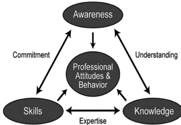
Figure 1: Model of Humanistic Design

decision might have an economic establishing.