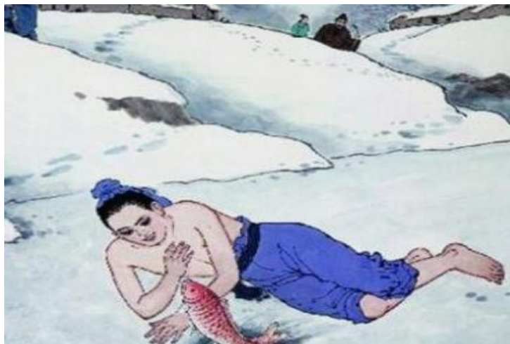
Figure 1: lie ice for carp

In the process of using literary works to carry out ideological and political education in colleges and universities, insufficient understanding is a key problem. Insufficient cognition mainly refers to the relatively weak consciousness, that is, there are problems in the cognition of the educational value of literary works (REN, 2022). Our country literature works are very rich, but colleges and universities can not make full use of them. College teachers can quote classics and use classical literature works to spread correct ideas and help students develop noble moral sentiments when teaching. A classic "teaching material" is the Yuan Dynasty literary work "Twenty-four filial Piety". In this literary work, 24 typical filial characters are used as examples, such as "lying on ice and asking for carp" (as shown in Figure 1), to demonstrate filial piety.