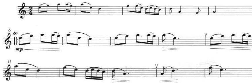
Figure 1: Example of the score of Kangding Love Song