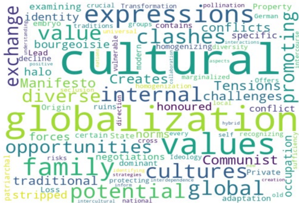
Figure 5: A Word Cloud of the Impact of Globalization on Cultural Values and Marx's Arguments.

Moreover, our analysis (see Figure 5 and Table 2) also unveiled potential downsides of globalization, particularly the risk of cultural homogenization. In "The Origin of Family, Private Property and State," Marx warned that dominant cultures could impose their values leading to the decline of distinct cultural expressions, especially among marginalized groups. Therefore, this potential loss like the possible "ruins of the patriarchal family" mentioned by Marx, underlines the importance of recognizing and actively promoting cultural diversity in the face of globalization. Lastly, as Marx suggests in "The German Ideology," globalisation could also foster the "intercourse in every direction" between cultures, enabling the exchange and cross-pollination of diverse values. Therefore, this interrelationship is a departure from past isolation and can lead to the creation of new hybrid cultural expressions and a deeper understanding between different communities.