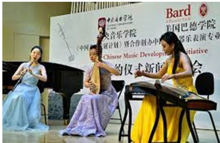
Figure 1: Historic and Cultural Wealth

The history of traditional Chinese music dates back thousands of years in China. This encompasses not just orchestral music but also folk and regional music. Traditional Chinese instruments like the guqin, erhu, and pipa have distinct tones that help form a particular musical culture (Minors, 2021). The Chinese government has aggressively supported cultural diplomacy through the use of music to reach out to other countries. Increasing global familiarity with China and its culture, musical performances from the country are frequently featured in cultural exchange and Confucius Institute events. The proliferation of digital distribution channels has sped up the globalization of Chinese music (Figure 1).