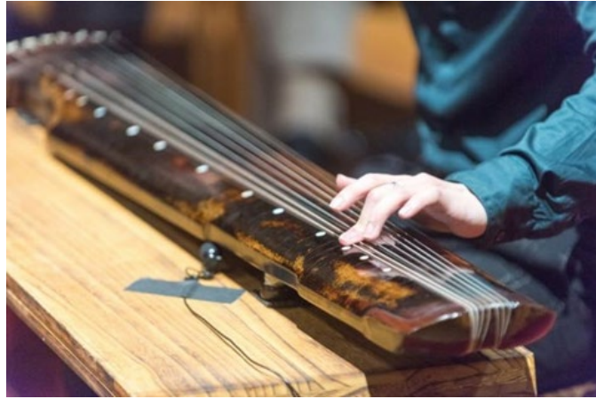
Figure 2: Music Interaction