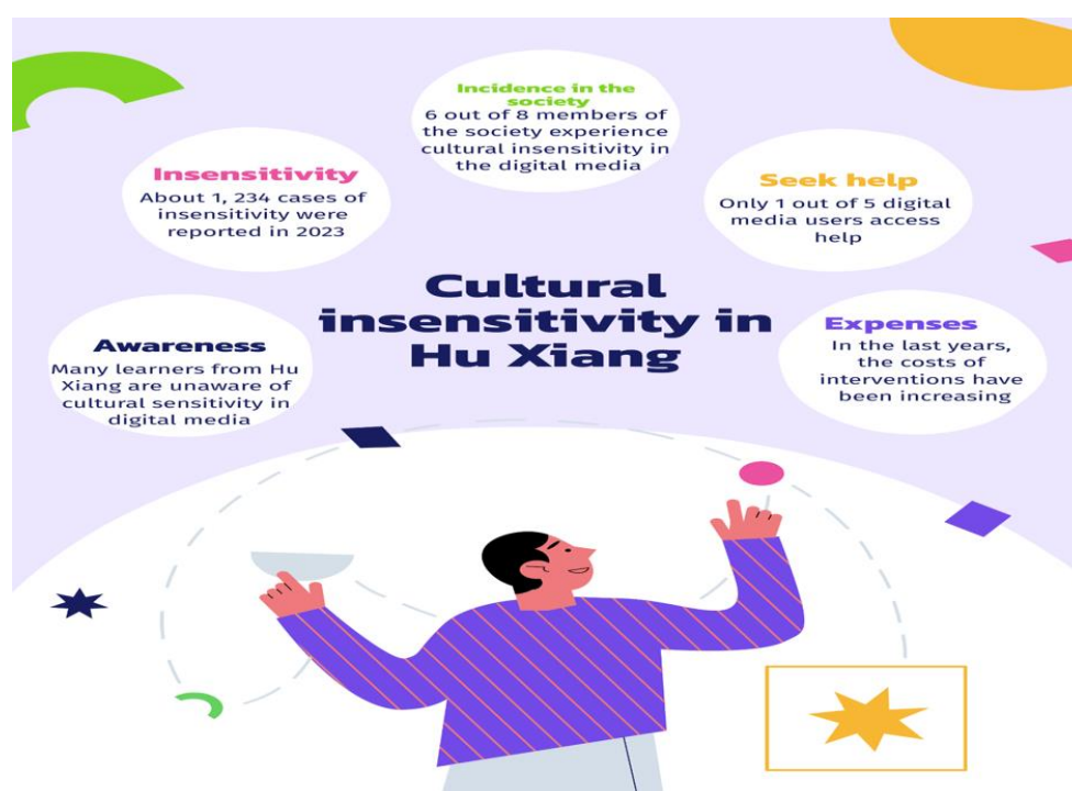
Figure 1: Facts about Cultural Sensitivity

cultural diversity due to the large catchment. Cultural diversity poses a threat to digital coexistence due to stereotypes and discrimination (EL-Sakran & EL-Sakran, 2021; Häkkinen et al., 2020; Pradhan, 2021). Discrimination emerges from diverse and unaligned cultural values, practices and traditions among individuals. Often, the stereotypes and discrimination result in intolerance and bias, destabilizing relationships and communication among culturally diverse persons. In the practical world settings, 6 out of 10 people face cultural intolerance, with a total of 1 234 cases reported in digital media in 2023 in the Hu Xiang region (Figure 1).