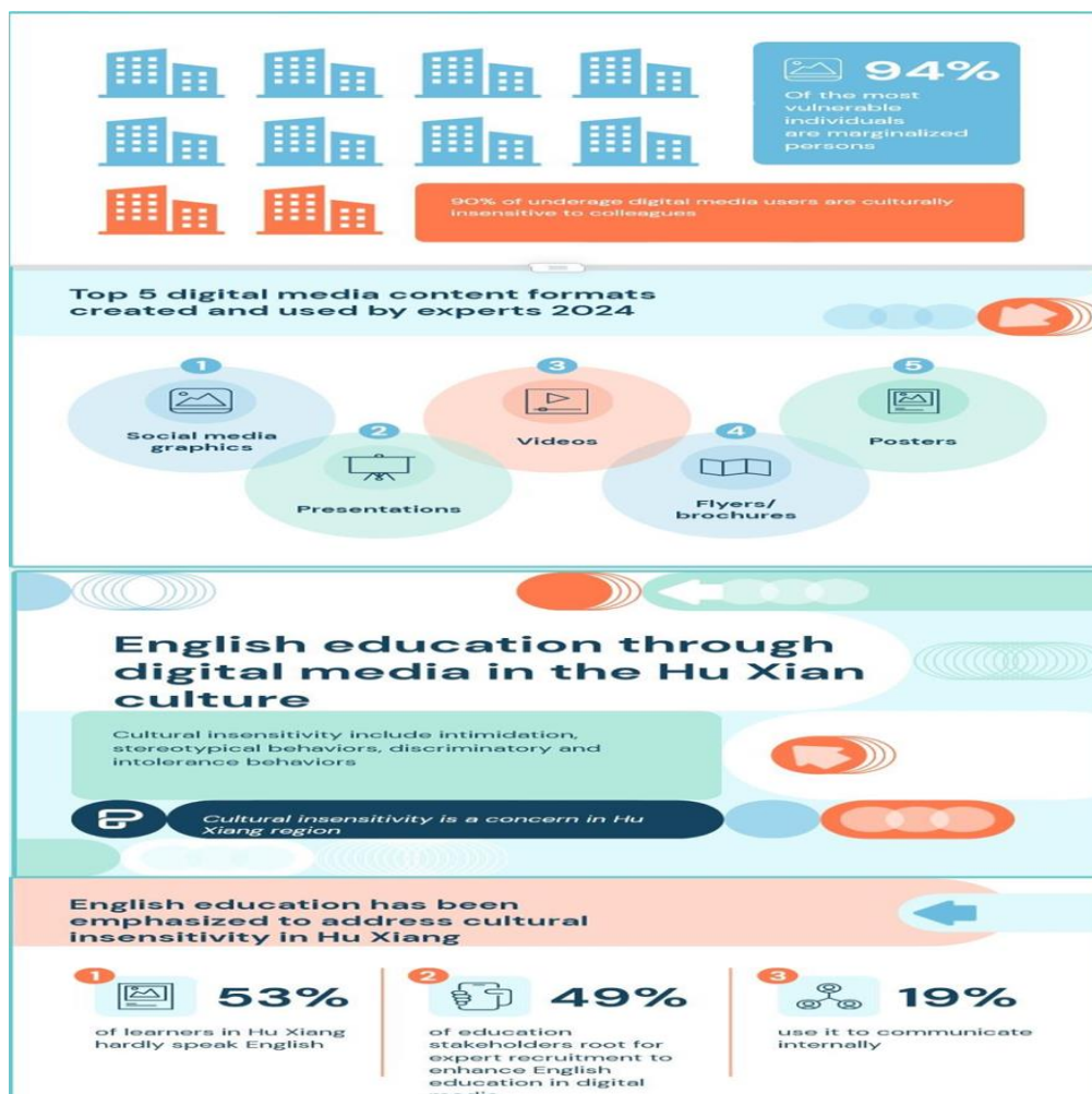
Figure 2: The Intricate Nature of Teaching English in a Culturally Diverse Digital Media