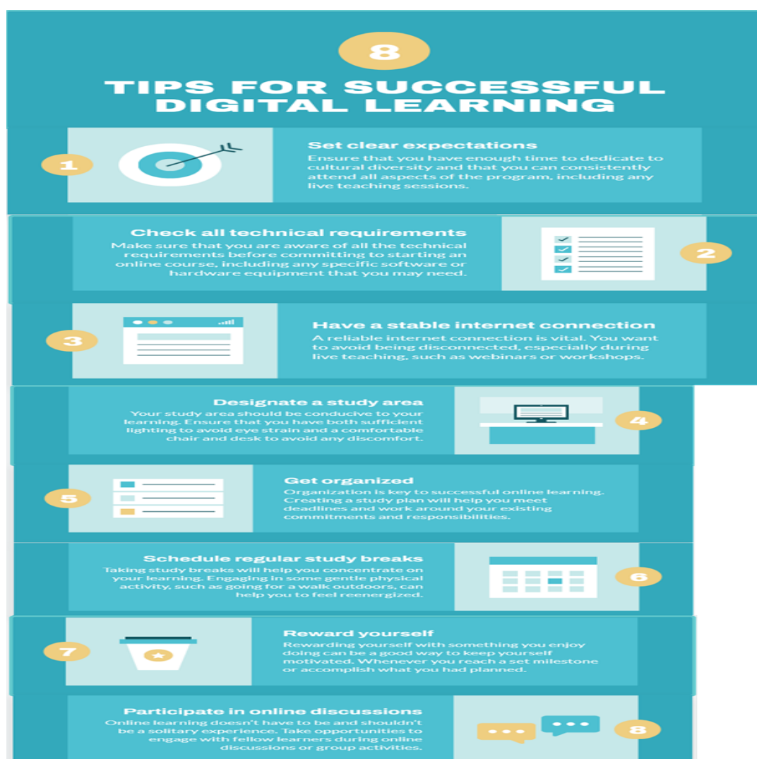
Figure 3: Enhancing Cultural Sensitivity in a Diverse Cultural Environment Through Presentation

approaches, behavioral traditions, regulations and particular rules shared within the greater diverse society, and constrain how they treat culturally diverse colleagues (EL-Sakran & EL-Sakran, 2021). Consequently, cultural sensitivity unveils a broader view, opening a window for embracing persons of diverse cultures. For instance, embracing diversity is a key strategy for enhancing cultural diversity in a diverse digital environment. Learners need to embrace cross-cultural relations, mindfulness and open mindedness when interacting with culturally diverse persons. These approaches broaden understanding and acceptance of the diverse cultural and social principles, views and perspectives, as illustrated in Figure 3.