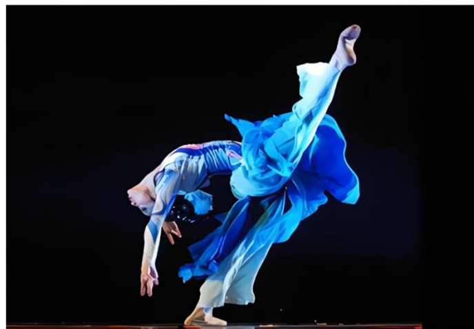
Figure 6: Examples of Dance Movements in Classical Chinese Dance

In classical Chinese dance, the law of neutralization and harmony is a unique way of dynamic manifestation, in which neutralization is the core of the law of movement of classical Chinese dance, and harmony is the essence of the law of movement of classical Chinese dance. It deeply embodies the artistic characteristics and aesthetic pursuit of classical Chinese dance. This law of movement not only runs through the whole dance, but is also reflected in every detail of the dance. Taking Figure 6 as an example, it can be summarized into two aspects as shown in Table 2.