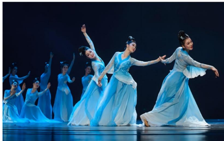
Figure 3: Cultural Connotation Embodiment of Chinese Classical Dance

Secondly, from the cultural dimension, classical Chinese dance is an important part of Chinese traditional culture. It embodies the cultural essence and aesthetic concepts of the Chinese nation, and shows the spiritual outlook and emotional world of the Chinese nation through the form of dance. Classical Chinese dance is not only an art form (Santi, 2022), but also a cultural carrier, which inherits and carries forward the cultural tradition of the Chinese nation. Specific forms of expression are shown in Figure 3.