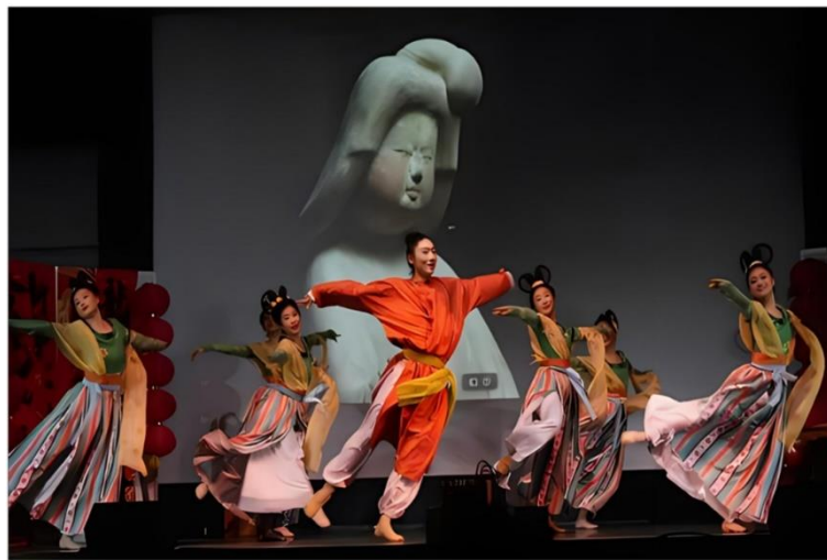
Figure 4: Embodiment of the Artistic Connotation of Chinese Classical Dance

Again, from the artistic dimension, Chinese classical dance has unique artistic characteristics and aesthetic value. It pays attention to the use of body rhyme, emphasizes the flexibility and coordination of the body, and shows various aesthetics such as elegance, elegance and robustness through dance movements (Lesong, 2022). At the same time, classical Chinese dance also pays attention to the creation of mood and emotional expression, through the dance movement and music, conveying a profound emotional connotation and artistic mood. The specific expression is shown in Figure 4.