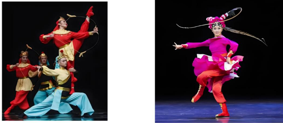
Figure 2: The Historical Connotation Embodied of Chinese Classical Dance

First of all, from the historical dimension, Chinese classical dance originated in ancient China and has a long history of inheritance. It is rooted in the ancient court dance and more distant folk dance, and through the refining, organizing, processing and creation of professional workers of all generations (Barona & Malafouris, 2022; Boson et al., 2023), it has gradually formed a dance form with unique style and exemplary significance. In the process of development of Chinese classical dance, it has also incorporated various artistic elements such as opera, martial arts, acrobatics and so on, forming a unique performance style. The specific performance forms are shown in Figure 2.