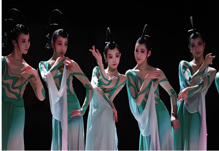
Figure 5: Example of Chinese Classical Dance Demeanor

embodies the spiritual connotation and aesthetic pursuit of classical Chinese dance, and perfectly integrates the form and connotation of dance, technique and art, body and mind. Taking Figure 5 as an example to analyze it, it can be summarized into the two aspects shown in Table 1.