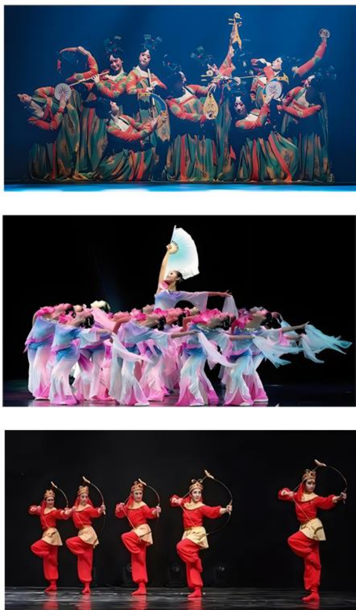
Figure 7: Examples of Forms in Classical Chinese Dance

In classical Chinese dance, the aesthetic pursuit of integration in diversity is one of its unique artistic characteristics, which demonstrates the deep cultural connotation and aesthetic value through the dynamic manifestation of dance. This aesthetic pursuit is reflected in all aspects of the dance, including movement design, performance style, emotional expression and so on. Taking Figure 7 as an example, it can be summarized into the three aspects shown in Table 3.