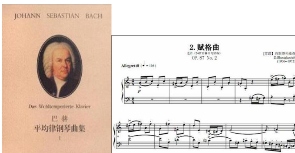
Figure 1: The Collection of Piano Pieces in Mean Time and Fugues

profound connotation of cross-cultural exchange. Beethoven's musical works incorporate the exploration and reference to the Oriental music, and this kind of integration is not only reflected in the music's emotional expression and theme selection, but also in the use of Oriental music rhythm and rhyme (Pilcher, 2013). Beethoven deeply understood the inherent charm of Oriental music and incorporated it into his own musical creation, forming a unique musical style. His works such as Symphony No. 9 and Symphony of Fate fully demonstrate the skillful use of oriental music elements, injecting new emotions and connotations into western classical music. Beethoven's intermingling of Eastern musical elements is not only reflected in his works, but also in his personal cross-cultural experience and spiritual world. Beethoven's music creation concepts and emotional expression have had a profound influence on later generations of musicians, promoting cross-cultural exchanges and fusion between Western music and Eastern music. The intermingling of Beethoven and Oriental music elements is not only a contribution to music and art, but also an important symbol of cross-cultural exchange and fusion, which provides an important historical legacy and cultural resources for the Western and Eastern construction of cello music.