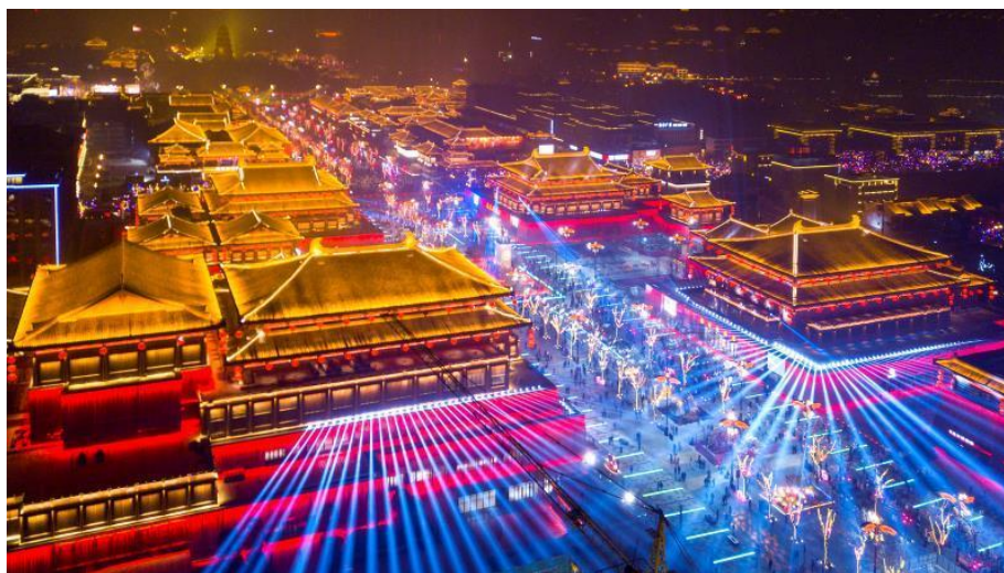
Figure 3: The City that Never Sleeps

instance, exhibitions like 'The most beautiful China, I see Xi'an' and 'Chang'an Memory, intangible cultural heritage exhibition' offer a deeper understanding of Xi'an's history and culture. By engaging with these exhibitions, visitors not only gain knowledge about the city but also develop a stronger sense of belonging.