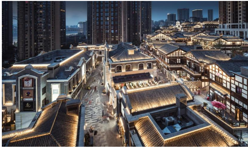
Figure 2: Danzishi Old Street, Changjiahui, Chongqing

adds to its cultural wealth. Lastly, Chongqing holds significant historical and cultural value as the birthplace and integral part of Ba and Yu culture. Various forms can be utilized to depict visual elements in Chongqing, including architecture, humanistic aspects, landscapes, and symbols. Architecture encompasses elements such as architectural style, shape, and structure. Humanism encompasses the urban customs and traditional attire found in the region.